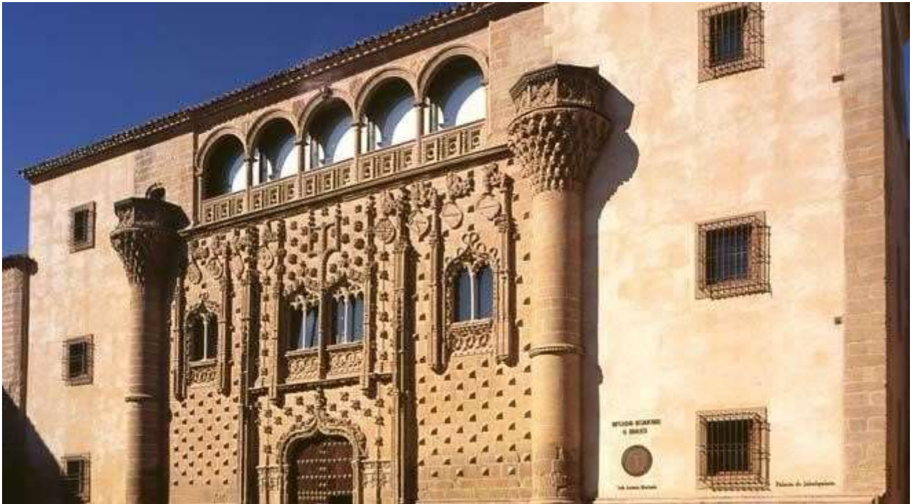
Palace of Jabalquinto, Baeza